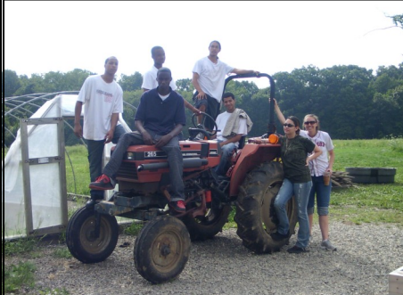
Clockwise from upper left: Grafton Job Corps' Community Harvest Project; Tongue Point Vegetable Garden; Tongue Point Diversity Garden; Grafton students posing with their tractor