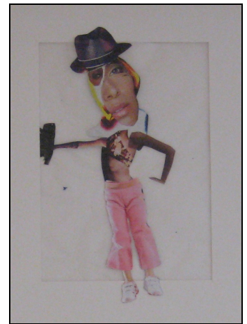
Job Corps students and staff and MOCA representatives gathered to celebrate student art work, including the pieces above.