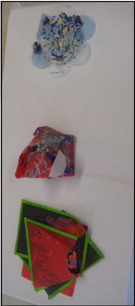
Above: Sculpture from MOCA/Job Corps art opening; below left: collage from opening; below right: students and staff view artwork