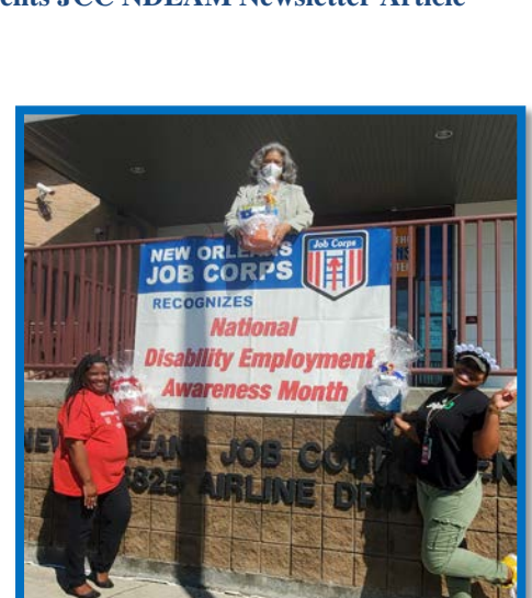
New Orleans JCC NDEAM Activities

New Orleans: The center staff and students participated in the NDEAM celebration throughout the month of October with a variety of activities to include displaying information and visuals of employing individuals with disabilities, their rights in the workplace, and how important it is for them to be